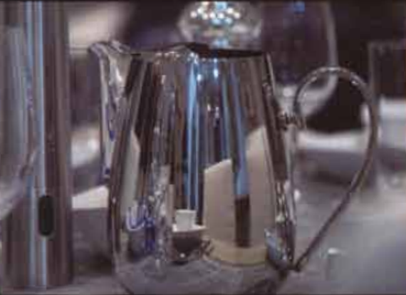
Broggi stainless steel water pitcher. €79.20. Available at Fino. Louis candle holders in silver glass. €43. Available at Ideacasa. Herve Gambs white glass vase and floral bouquet of roses - available at camilleriparismode.

Ville Michel is a development of 35 luxury apartments and two penthouses in Mellieha. Every inch of this expansive complex reflects the combined touch of skilled workmanship and sophisticated décor well suited to modern, opulent living.