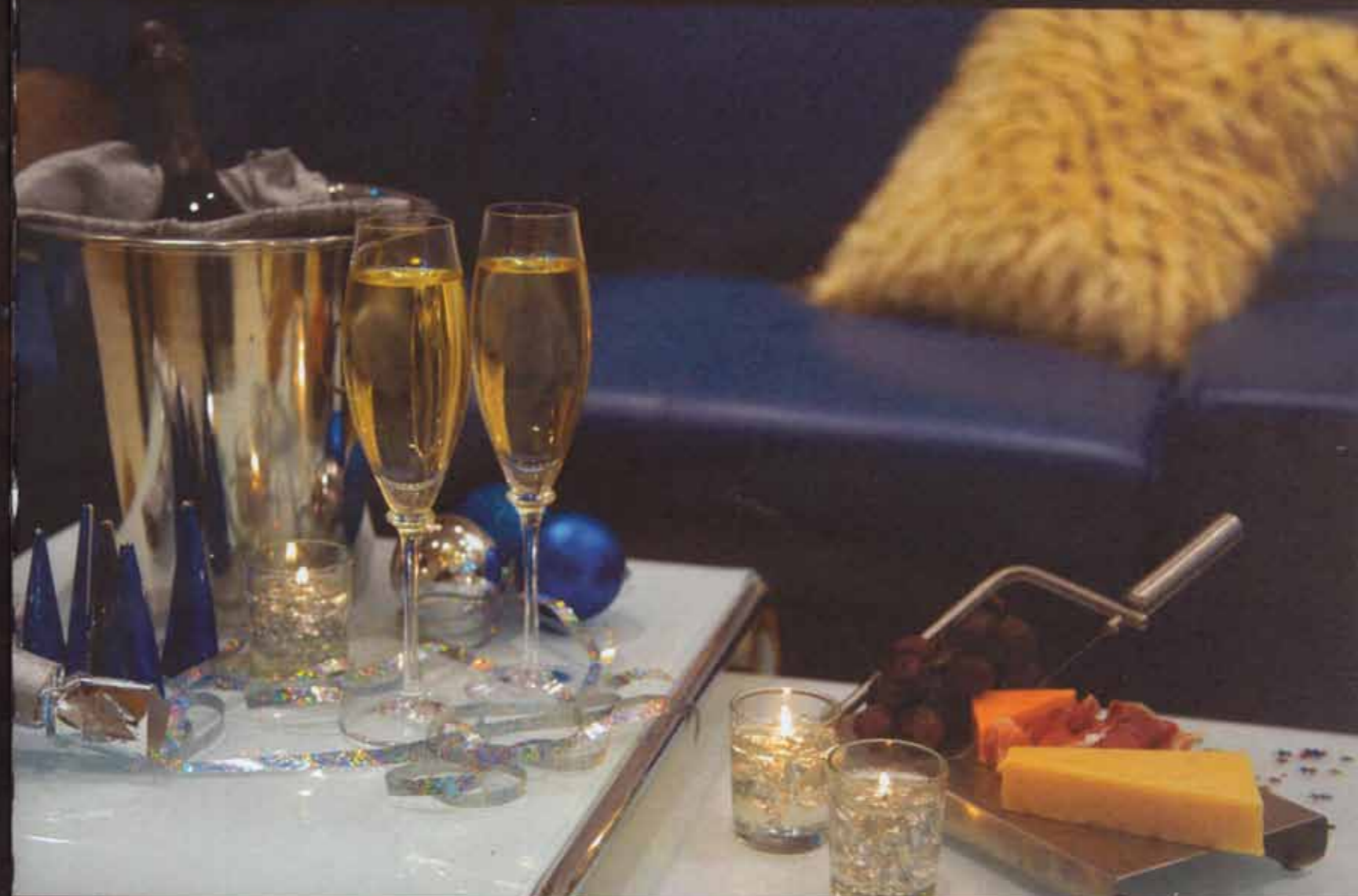
Haviland Limoges France champagne flutes. €51.25. Available at Fino. [Below] Bougies La Francaise scented candle in glass container with bamboo lid. €19.